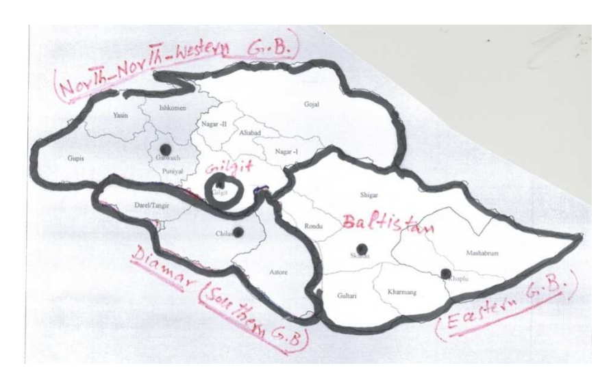
Map 2: GB divided into three sub-regions.

Even according to the latestreforms; 'the GB Empowerment and Self-Governance Order 2009" key decisions are made by the Federal Government. For instance according to the 2009 order the majority of the members of the Upper House (GB Council),the Prime Minister as Chairman, the Governor, the Chief Judge, the Federal Minister for Kashmir Affairs and six out of a total of 12 members are to be appointed or nominated by the Federal Government.<sup>24</sup>